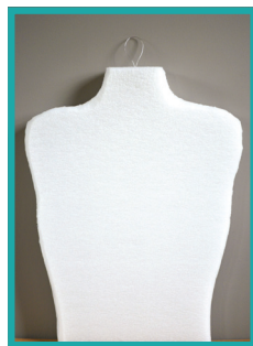
The Exeter (S1) 23"×18.5"×2.25" $200