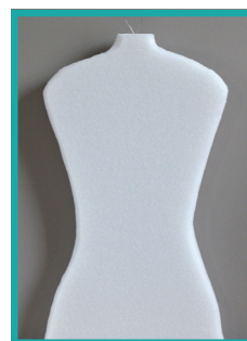
The Kennebunk (S5) 26"×15"×2.25" $200