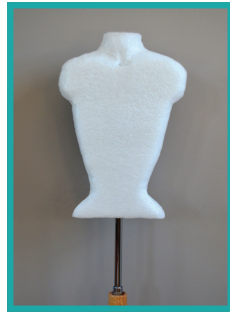
The Cambridge (M2) 18.25"×11"×4.25" $200