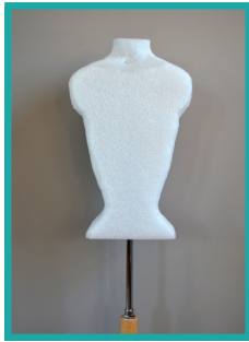
The Andover (M1) 17.75"×10"×4.25" $200