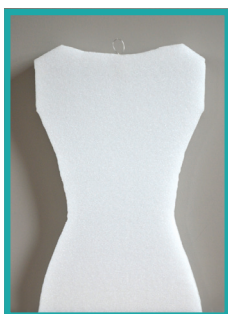
The Newport (S3) 25.5"×17.5"×2.25" $200