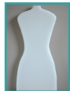
The Portsmouth (S6) 34"×15.5"×2.25" $250