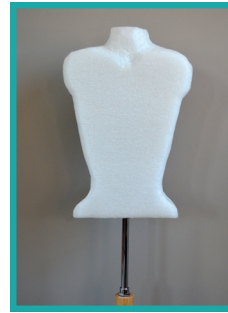
The Hampton (M3) 19"×12"×4.25" $250