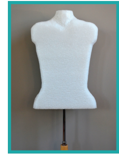
The Shelburne (M4) 20"×13.5"×4.25" $250