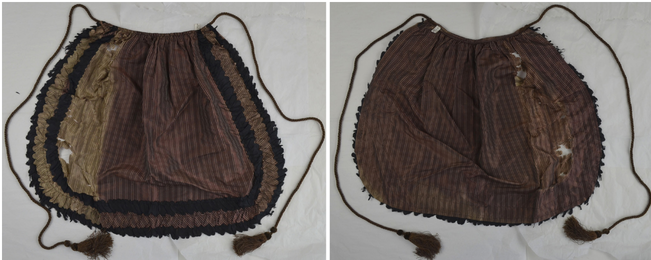
Fig. 13. Front and back of the Abigail Adams apron, before conservation.

from extensive light exposure leading to physical instability, loss of material, and color change (fig. 13). Because the silk disintegrated easily when stitched, an adhesive lining was the best option for stabilizing the apron enough to allow for display. A sheer underlay of brown polyester Stabiltex was found to provide the best support and color compensation in areas of loss.