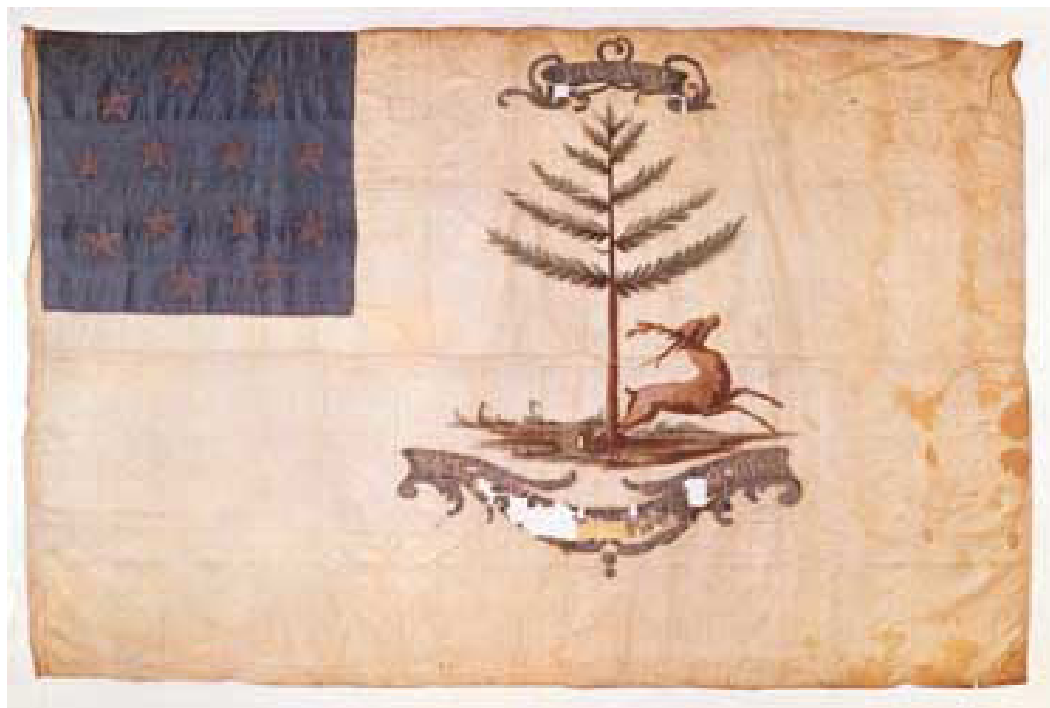
Fig. 1. The Bucks of America flag before conservation.