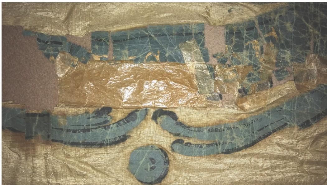
Fig. 2. Detail of prior repairs to the Bucks of America flag.

collation in a neighboring town, and, en route, were requested to halt in front of the Hancock Mansion, in Beacon Street, where the Governor and his son united in the presentation.