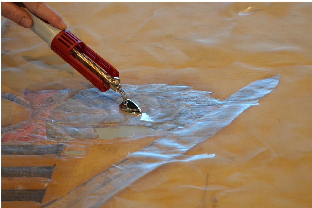
Fig. 10. Applying the silk crepe underlay to the back of the Third Connecticut Regiment flag using a tacking iron.

flag was given a powder-coated welded aluminum frame. The Third Company, Third Connecticut Regiment flag was returned to the New-York Historical Society and displayed in the 2016 exhibit The Battle of Brooklyn (fig. 11).