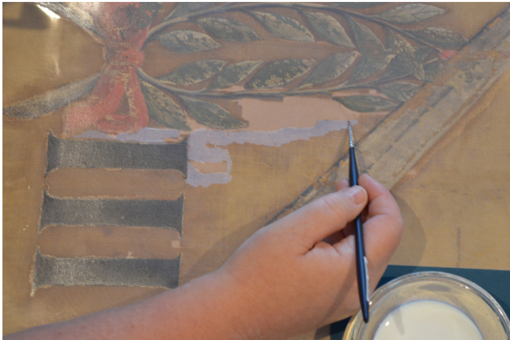
Fig. 9. Self-stenciling the silk crepe underlay for the Third Connecticut Regiment flag.

flag was given a powder-coated welded aluminum frame. The Third Company, Third Connecticut Regiment flag was returned to the New-York Historical Society and displayed in the 2016 exhibit The Battle of Brooklyn (fig. 11).