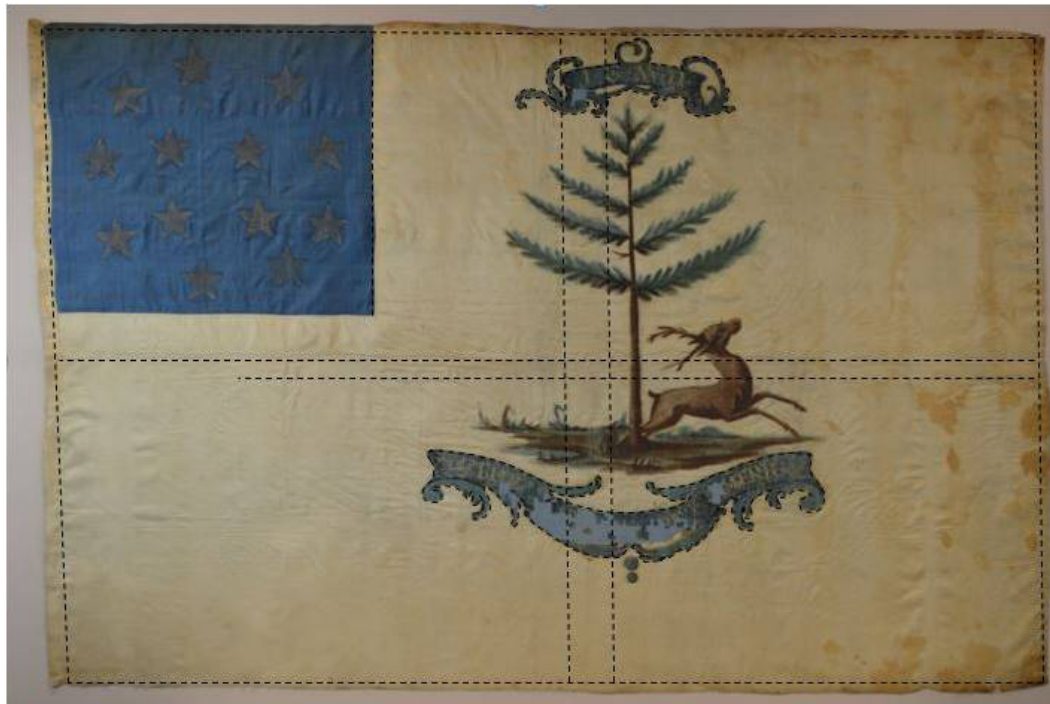
Fig. 6. Stitch diagram for the Bucks of America flag.