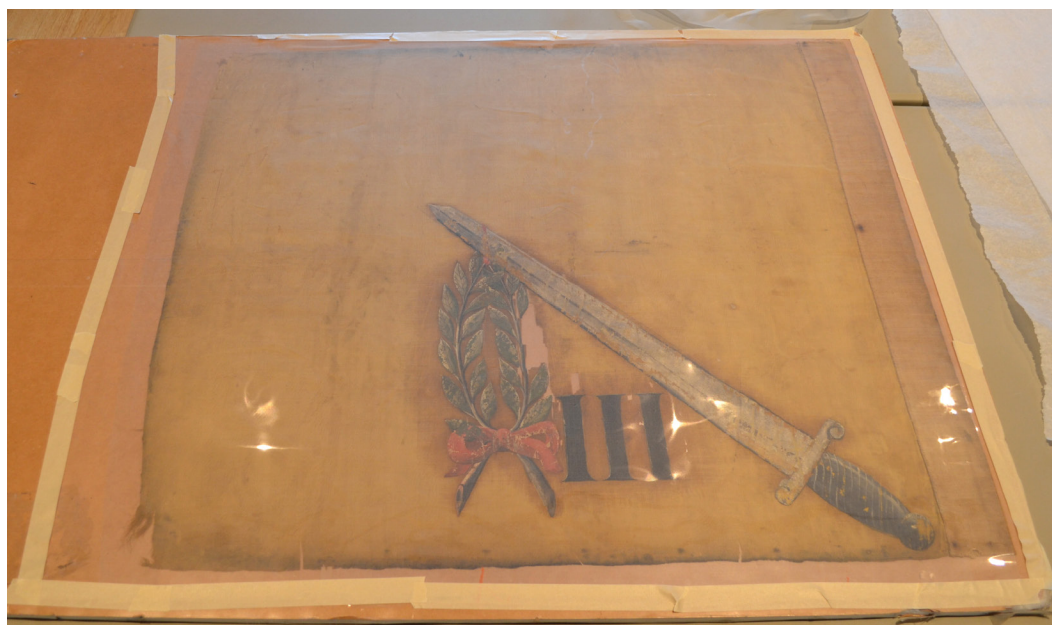
Fig. 8. Reverse of the Third Connecticut Regiment flag covered by silicone release film followed by silk crepeline.