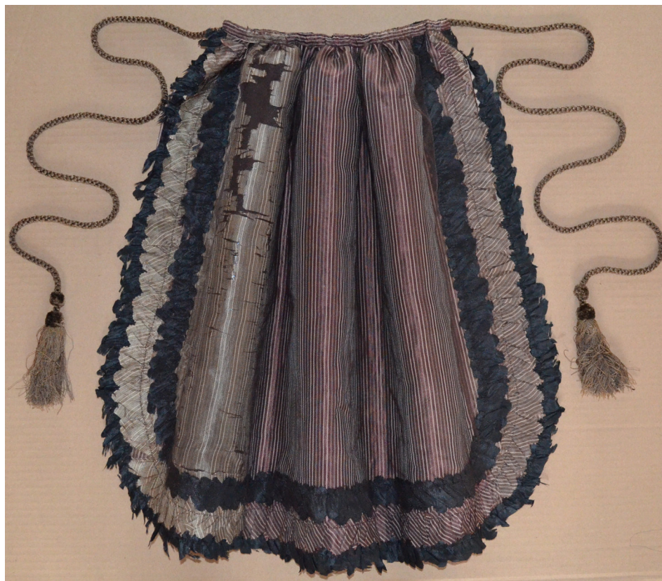
Fig. 15. The Abigail Adams apron after conservation.

silk to powder and split in all directions. Approximately 20% of the original silk was missing or not suitable to reuse in the conservation treatment. A solution was needed, therefore, to consolidate the remaining pieces of the dress onto a new silk lining so that the dress could be reassembled and displayed.