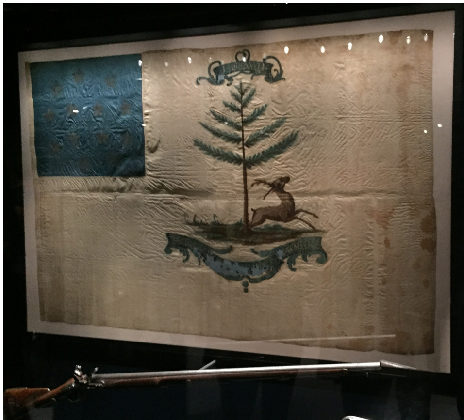
Fig. 7. The Bucks of America flag on display at the Smithsonian Museum of African American History and Culture.