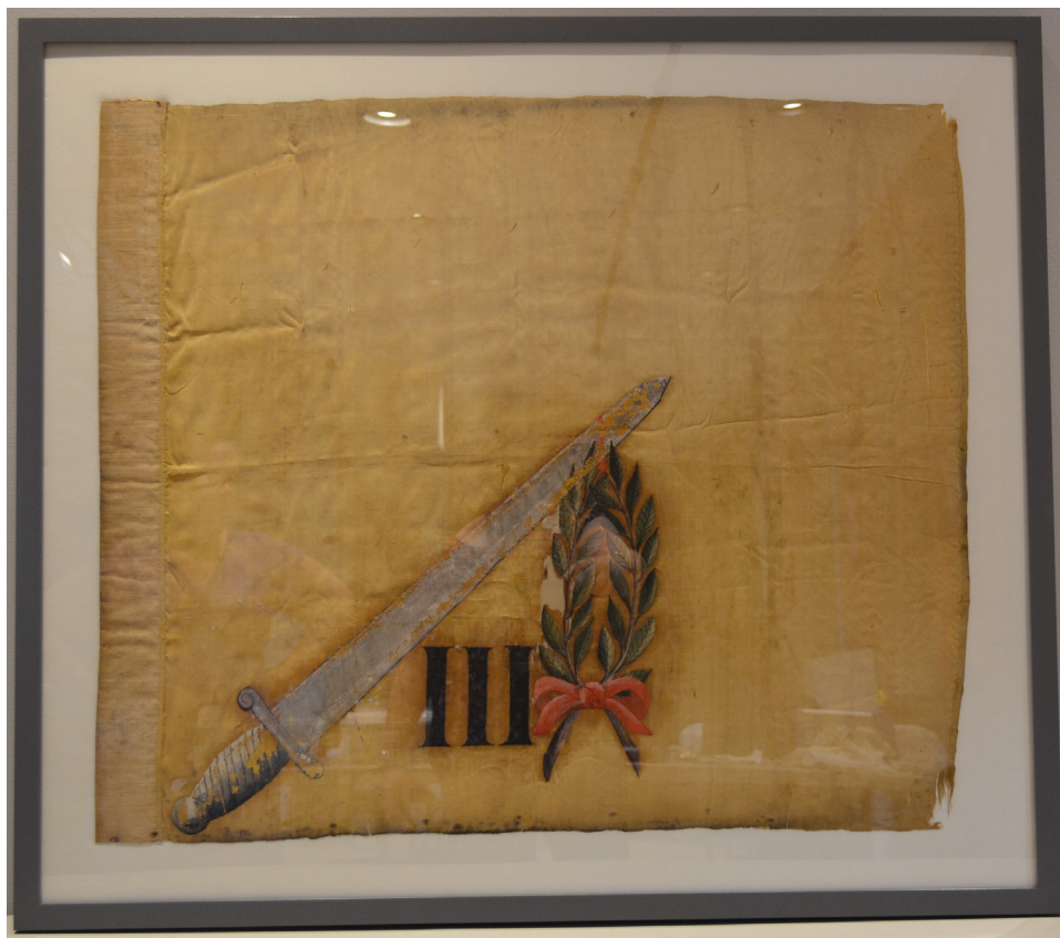
Fig. 11. The Third Connecticut Regiment flag after conservation.