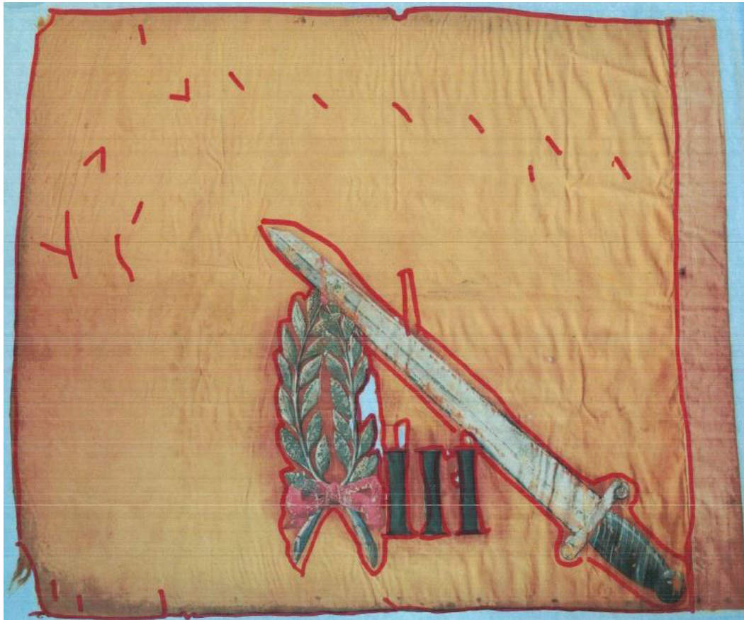
Fig. 12. Adhesive diagram for the Third Connecticut Regiment flag.

from extensive light exposure leading to physical instability, loss of material, and color change (fig. 13). Because the silk disintegrated easily when stitched, an adhesive lining was the best option for stabilizing the apron enough to allow for display. A sheer underlay of brown polyester Stabiltex was found to provide the best support and color compensation in areas of loss.