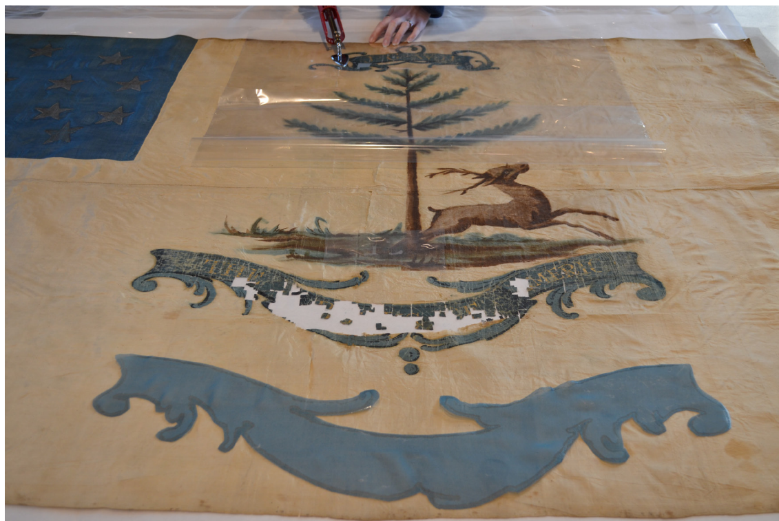
Fig. 5. Blue Stabiltex underlays for the Bucks of America flag after (top) and before (bottom) placement.

solution of Plextol B-500 in filtered water. Each was then repositioned face up onto the silk crepe lining and left to dry under moderate weight [note 2].