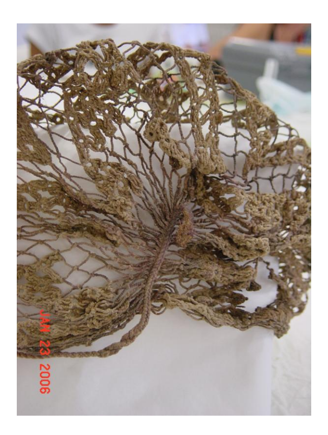
Treatment The textile was not treated at this time.

The body of this hat is a net made of vegetable fiber. Supplementary cotton yarns create geometric/zoomorphic designs. The hat was created by gathering a rectangle of net on each side with a braided cord; these cords then form ties which secured the hat. The cords are in the tied position. Although the hat is a dark natural-white color, there are indications that the net may have been pink. The fibers are brittle and broken in some areas.