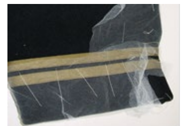
Sleeve with temporary net

Because it is meant to be removed, temporary netting can be done with a very visible color of net and thread. Stitches can be large and spaced apart. The area of weakness itself is often avoided; the technique relies on the strength of surrounding areas and of the net to provide support.