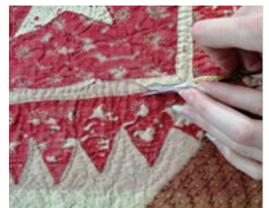
Trim the net carefully