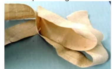
Netted silk ribbon