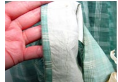
Stitches inside of a hem