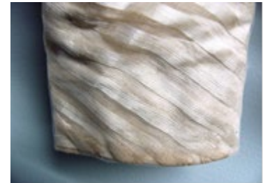
Net wrapped around a cuff