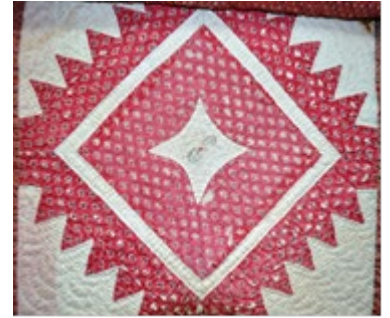
Net is larger than you need