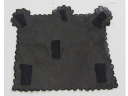
After cutting, the fabric shape will be taped to the Mylar tracing.