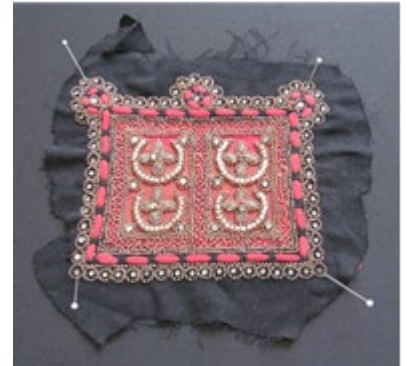
This beaded textile fragment was not in display condition due to the rough edges left when it was cut away from its original garment.