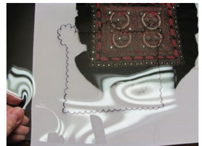
A Mylar tracing is made of the area around which the sheer overlay will fit. The Mylar was then carefully cut.