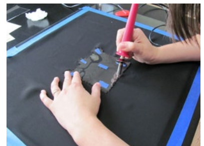
The Mylar tracing is taped to the polyester sheer and carefully cut using a commercial wood-burning tool.