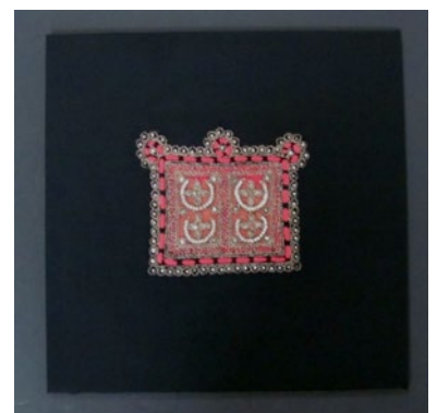
The voided overlay was hand stitched around the beaded design, wrapped to the back of the mounting board, and secured with hand stitching.